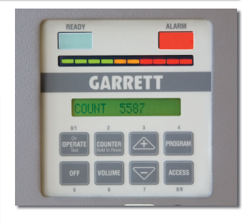
▲ The PD 6500i 's access control panel is designed for use with specific, multilevel security codes.